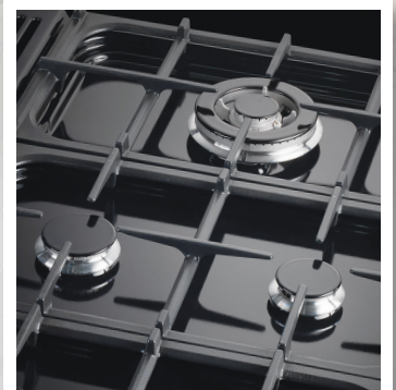
Flame failure safety device