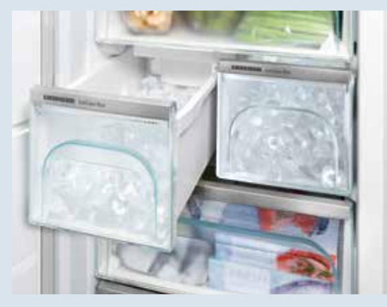
IceMaker: Liebherr's automatic IceMaker produces flawless crescent ice and keeps a constant supply on hand for every occasion.