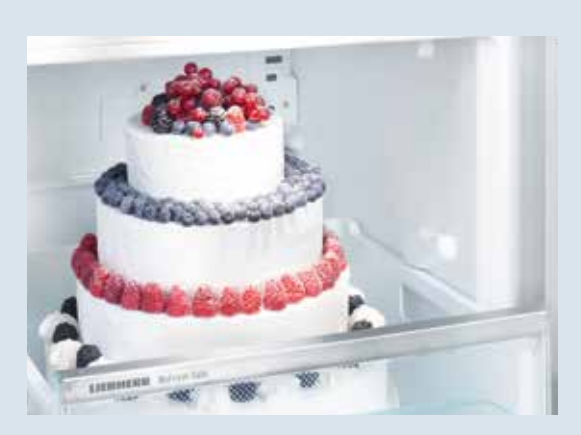
VarioSpace: The freezer includes include drawers and glass shelves that can be conveniently removed to create extra storage space. It's Liebherr's very practical solution to quickly accommodate even bulky items.

Volume, efficiency, economy, ease of use, and outstanding design are the key features of the SGNPbs 4365 BlackSteel freezer from Liebherr's BluPerformance series. Highquality components and materials, and perfect workmanship combined with precise touch electronics system are what made this appliance so efficient.