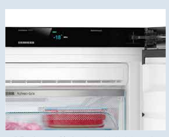
2.4" Touchscreen Display: Located behind the appliance door, this high-resolution and high-contrast 2.4" touchscreen display can be read from any angle. Stored menu options are Intuitive and easy-to-operate.