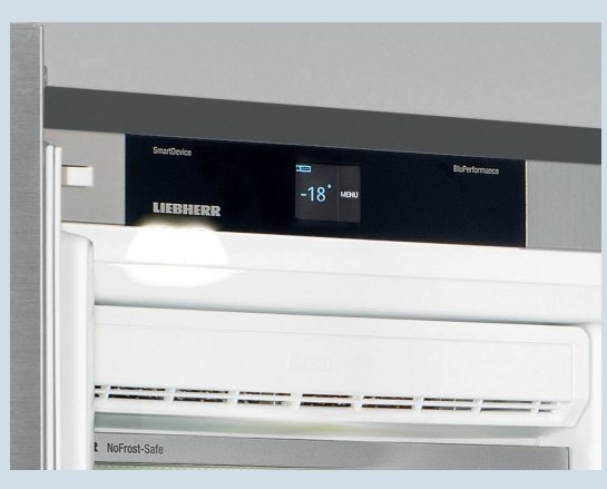
2.4" Touchscreen Display: Located behind the appliance door, this high-resolution and high-contrast 2.4" touchscreen display can be read from any angle. Stored menu options are Intuitive and easy-to-operate.