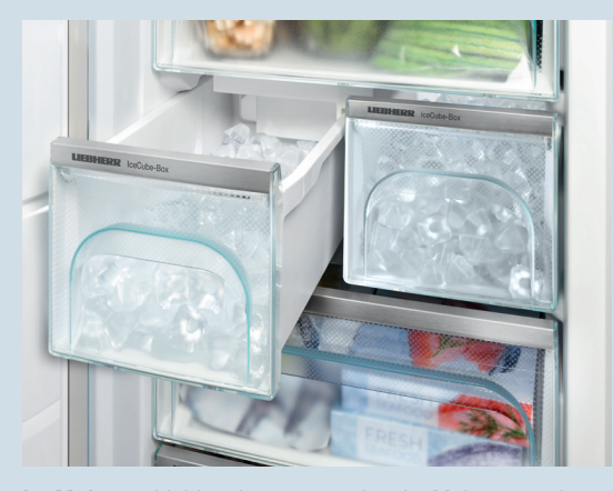
IceMaker: Liebherr's automatic IceMaker produces flawless crescent ice and keeps a constant supply on hand for every occasion.