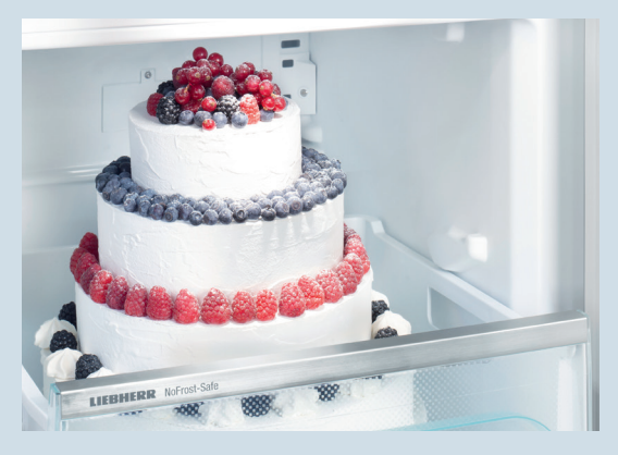
VarioSpace: The freezer includes include drawers and glass shelves that can be conveniently removed to create extra storage space. It's Liebherr's very practical solution to quickly accommodate even bulky items.

Volume, efficiency, economy, ease of use, and outstanding design are the key features of the SGNPes 4365 freezer from Liebherr's BluPerformance series. High-quality components and materials, and perfect workmanship combined with precise touch electronics system are what made this appliance so efficient.